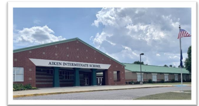
Title I School

SIC ANNUAL REPORT TO THE PARENTS 2022-2023