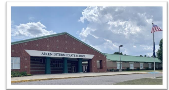
Title I School

SIC ANNUAL REPORT TO THE PARENTS 2023-2024