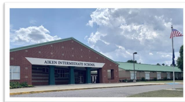
Title I School

SIC ANNUAL REPORT TO THE PARENTS 2024-2025