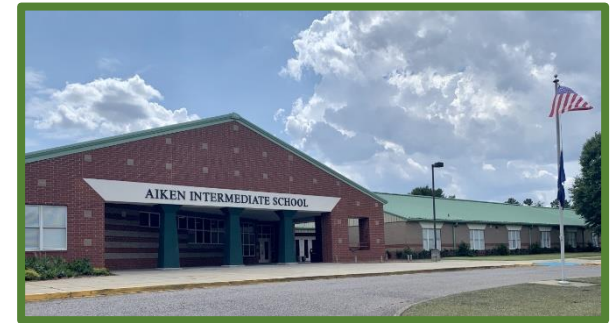
Title I School

SIC ANNUAL REPORT TO THE PARENTS 2019-2020