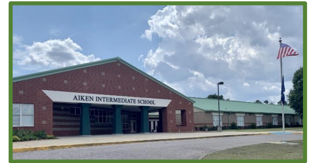
Title I School

SIC ANNUAL REPORT TO THE PARENTS 2020-2021