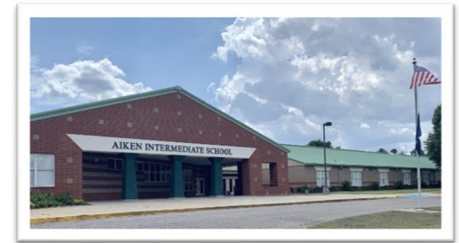
Title I School

SIC ANNUAL REPORT TO THE PARENTS 2021-2022