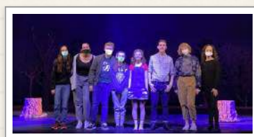
Asleep in the Wind