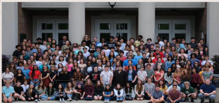
Scholars Academy 2022-2023