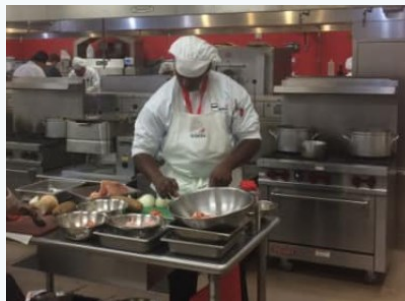
BEAUFORT-JASPER ACADEMY FOR CAREER EXCELLENCE