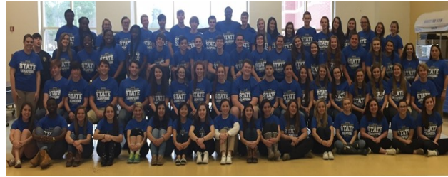
BETA Club State Champions