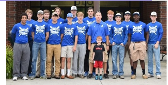
We encourage Community Involvement