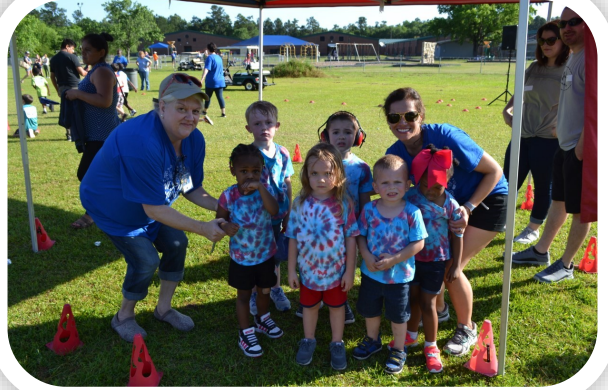
Boostertthon brings our BES community together!

Administration and teachers will receive and implement professional development in ELA and math small group instructional to support student achievement.