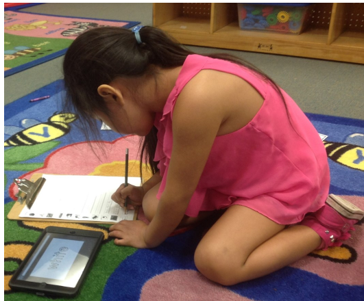
2013 - 2014 INTERVENTION