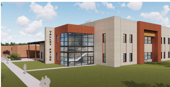
Artist's conception of new classroom building, estimated completion date is December 2020.