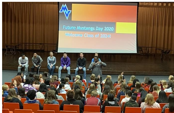
Future Mustangs are 8th graders — rising Freshmen — who receive an in-depth orientation to MVHS.

Statistical data demonstrates a pattern of improvement as well as areas in which we need to concentrate to continue growth.