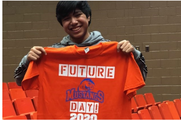
A future Mustang, visiting from one of our feeder middle schools, is excited to receive a MVHS t-shirt.