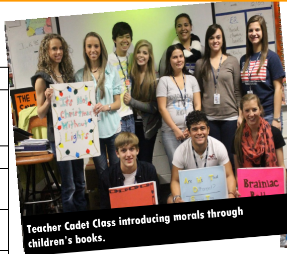
Teacher Cadet Class introducing morals through children's books.