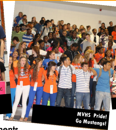
MVHS Pride! Go Mustangs!