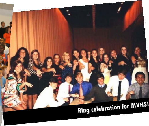
Ring celebration for MVHS!