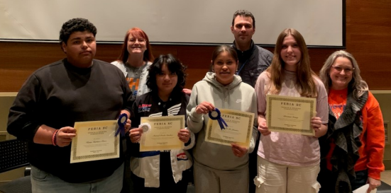
Our Spanish and French students represented MVHS again at Winthrop University in the World Language Competition. Our students brought home ribbons: 2 Blues in Spanish writing and speaking, 2 reds French in writing and speaking, and 1 white Spanish in writing.