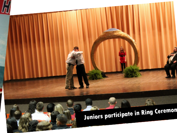
Juniors participate in Ring Ceremony