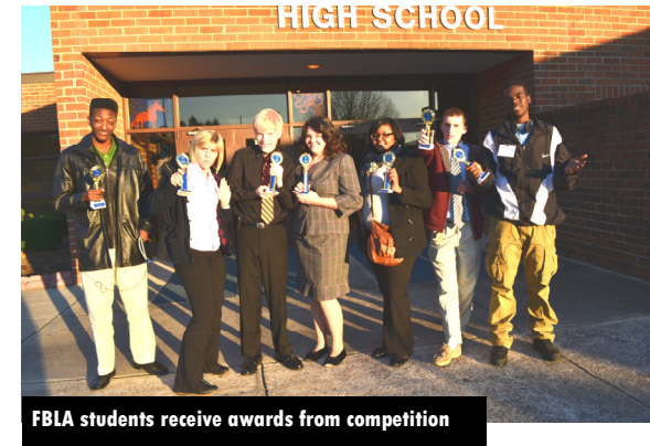
FBIA students receive awards from competition