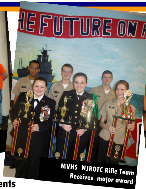
MVHS NJROTC Rifle Team Receives major award