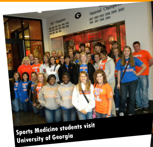
Sports Medicine students visit University of Georgia