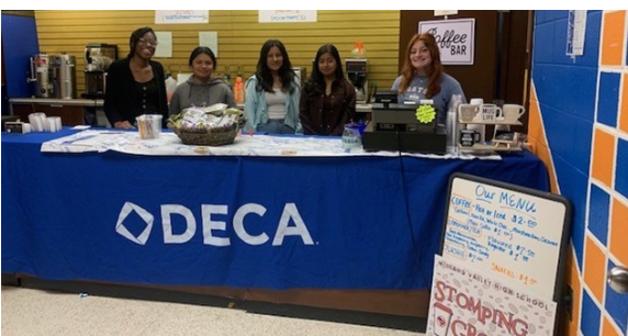
The School Store ran by DECA and students in the Marketing Program reopened this year. The students rebranded it and turned it into a café, Stomping Grounds Café. They sell coffees, flavored lemonades, tea, and slushies. Students who work in the café not only gain real-world, 21st century skills they also have a chance to receive certifications and work-based learning. Proceeds from the café go directly back into the school. The money raised is used to keep the café running and cover expenses for students to receive certifications, attend conventions, and compete in competitions. Five students competed in the regional DECA competition this year and all five placed in the top three in their divisions. Also, 16 students received OSHA-10 and Microburst Employment Skills certifications. So far this has been very successful, and students in the entire school benefit from it.