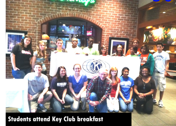
Students attend Key Club breakfast