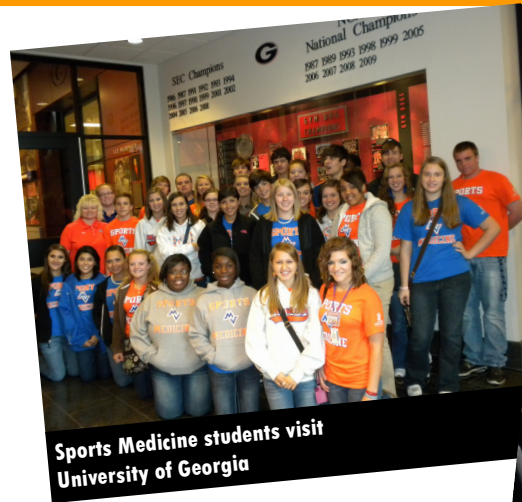
Sports Medicine students visit University of Georgia