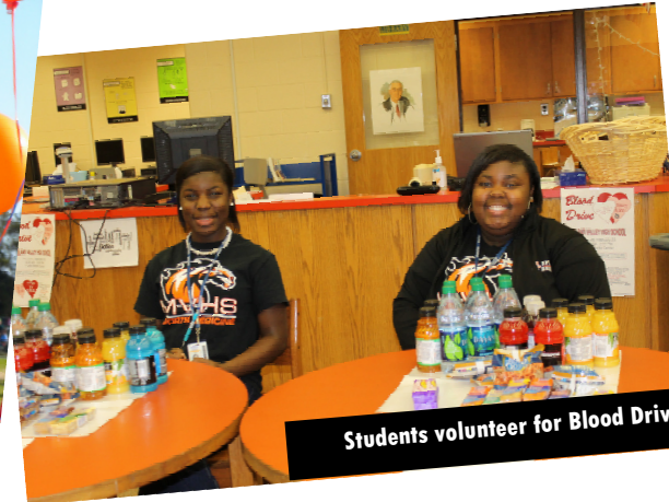
Students volunteer for Blood Drive