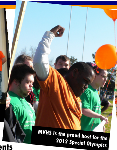
MVHS is the proud host for the 2012 Special Olympics