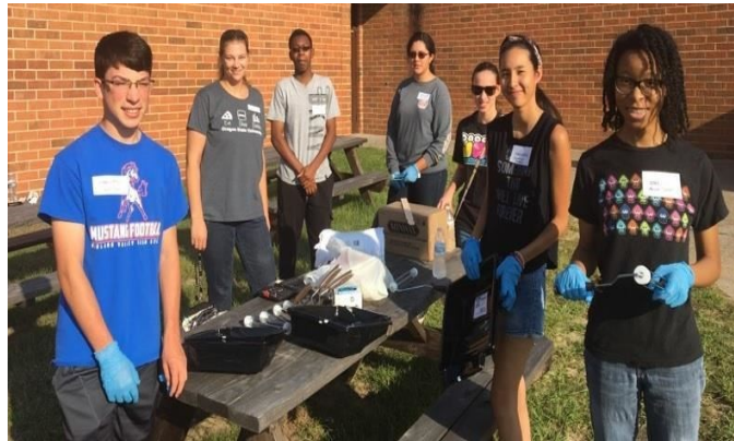
High School Survey Response