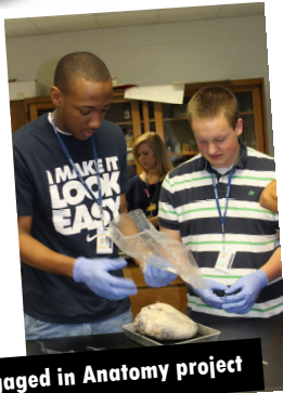
Students engaged in Anatomy project