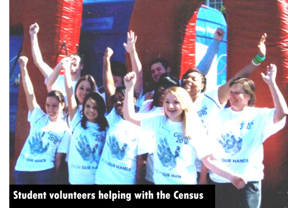
Student volunteers helping with the Census