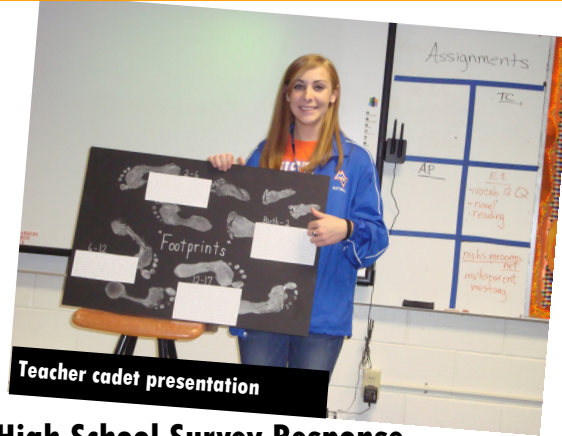
Teacher cadet presentation