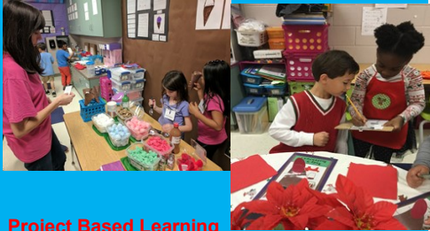
Project Based Learning