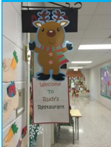
CPE's Living Museum