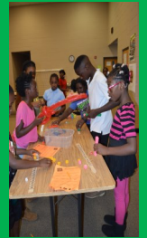
Family Math Night