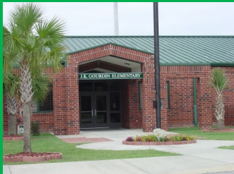
JKE at a GLANCE

JK Gourdin serves a population of 129 students from the Pineville/Russellville communities. Our student population includes the following demographics: 99% African American 1% Caucasian. Our school is a Title I school with 97% of students receiving free/reduced lunch.