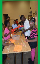
Family Math Night