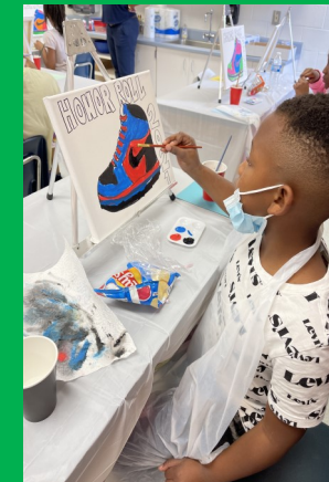
Honor Roll Incentive