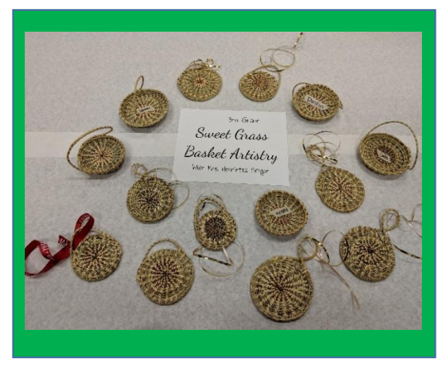
Artists in Residence

In addition to the core academic subjects, the AIMS philosophy includes standards-based instruction in dance, music, theatre, and visual art. Students have the opportunity to experience the arts through infusion lessons, exploratory classes, and arts integration in their core subjects.