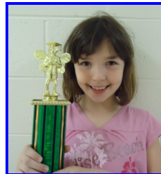
Students are encouraged to participate in district wide competitions.