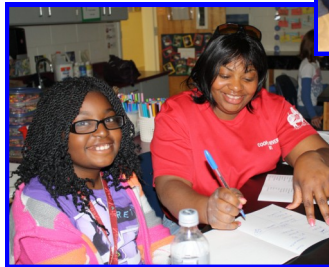
Families joined in the evenings to participate in our Literacy and Math family nights.