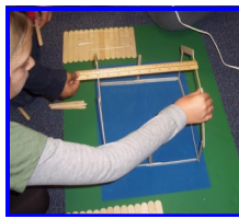
Students were an integral part in the design and planning of our new outdoor classroom.