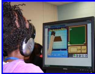
Technology is one of the tools we use for learning.