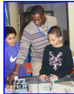
SFI participated in the annual Lego-Robotic competition.