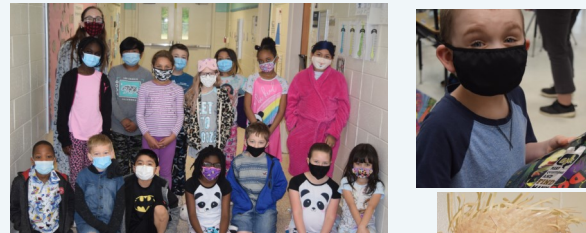
March Habit #6 Hawaiian Luau