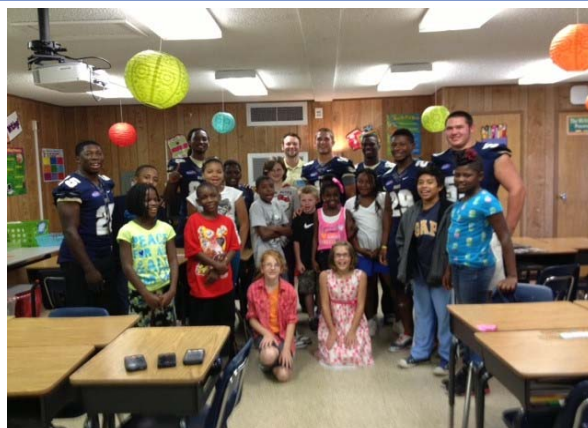
Charleston Southern University players read with our students