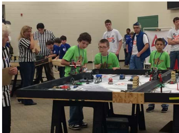
The Robotics Team won 5th place for programming accuracy