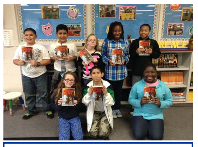
Students were invited to participate in afterschool clubs.