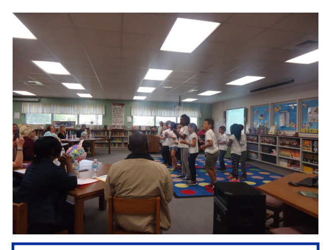
Students hosted their first Leader in Me Leadership Day.