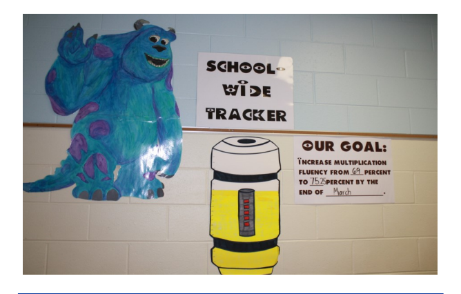
Math fluency was a "Wildly Important Goal" that was tracked weekly.