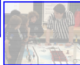
SFI participated in the annual Lego-Robotic competition.