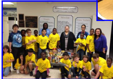
This year, SFI participated in the TriCounty Youth Service Day, collecting over 1400 lbs of food for Helping Hands of Goose Creek.