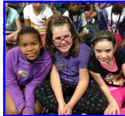
Students are encouraged to participate in district wide competitions.