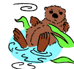
Our Mascot – BOB the Otter

To monitor each student's academic growth we utilize comprehensive data gathered from a variety of sources that will help us make informed decisions that will lead to increased results for every student. Multiple pieces of data give us a picture of the whole child to prepare for college and career readiness. Berkeley County utilizes universal screeners such as Pathdriver, DRA II and PALS. Goose Creek Primary will progress monitor our students utilizing Pathdriver and Benchmark Assessments from Fountas and Pinnell in order to make informed decisions for our students. We also utilize quick cycle assessments and manage data through an online management data base called Mastery Connect. Our teachers are knowledgeable with administering these tests and how to analyze the results to make informed decisions. Goose Creek Primary teachers participate in Professional Learning Communities weekly during which they collaborate on data analysis.