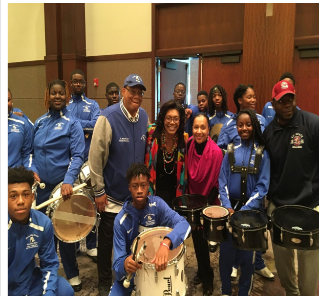
2019 Band Performance