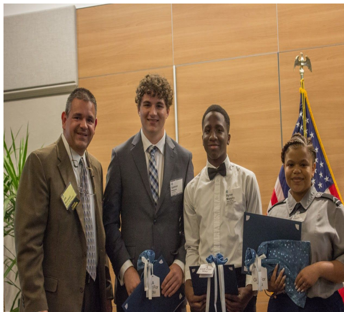
2019 Settle Awards Ceremony