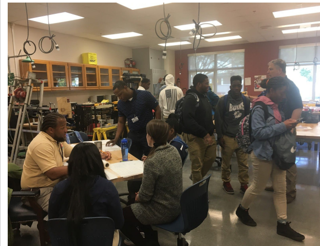
2019 ACE Mentors in a CTE class