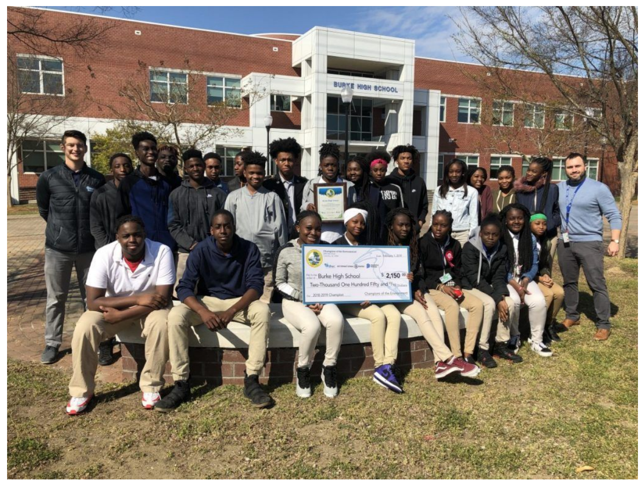
Students in 9th grade geo-science classes received the Champion of the Environment Award , sponsored by Dominion Energy, International Paper, and the SC Department of Health and Environmental Control (DHEC), for their project on Oyster Reef Habitat Restoration.

Burke High School Annual School Improvement Council Report to the Parents 2018-19