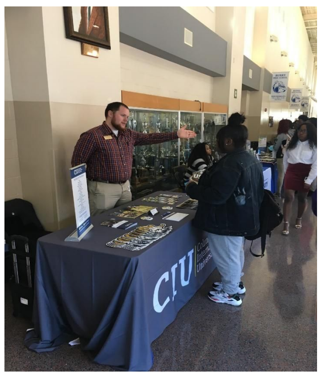
College & Career Fair Symposium