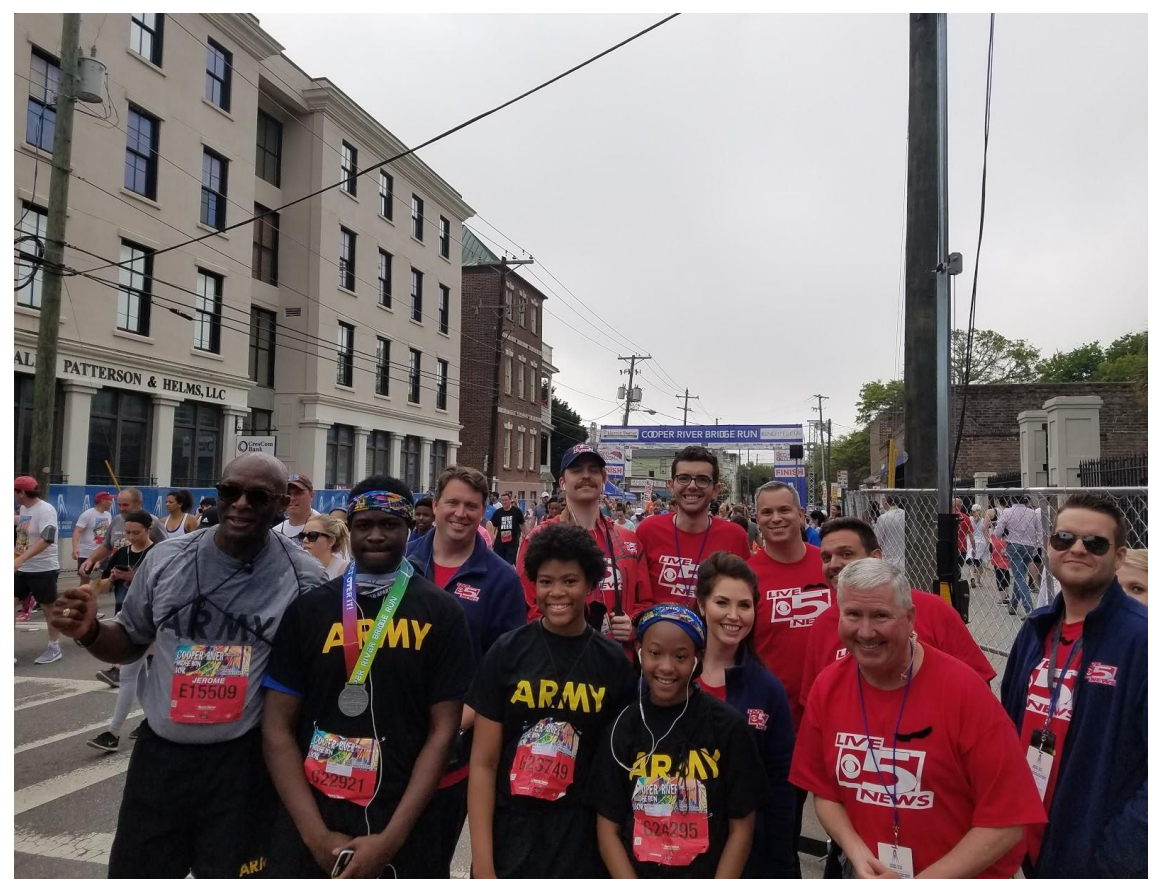
JROTC students participate in Ravenel Bridge Run