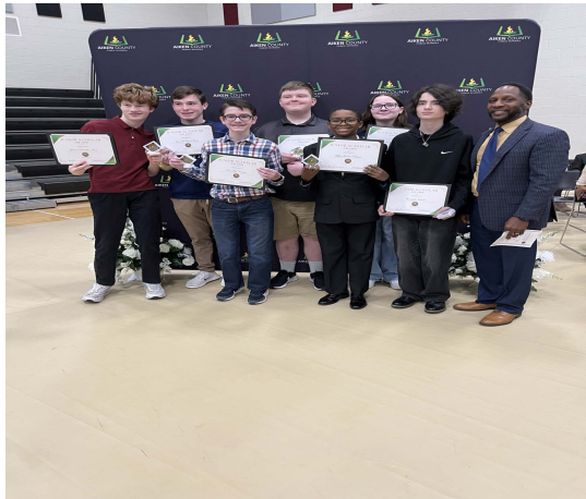
Our 2024-2025 Junior Scholars!

New Ellenton Middle STEAM Magnet School is a Title I school that receives federal funding based on the poverty index of our school. This funding is intended to assist in providing programs and educational opportunities to our students. This year, Title I funds were utilized to pay a teacher’s salary for class-size reduction, purchase technology, instructional supplies, educational resources, student incentives, to fund professional development opportunities, and sponsor parental involvement activities.