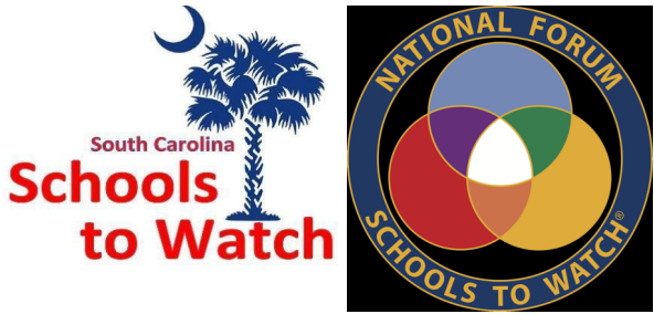
NEMS was designated as a SC School to Watch and inducted into the National Forum.

CONNECT WITH US: https://www.acpsd.net/o/nems Facebook: @New Ellenton Middle STEAM Magnet School