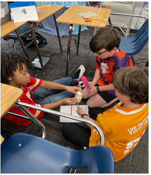
STEAM in the Classroom! Students use the Engineering Design Process to create various models.