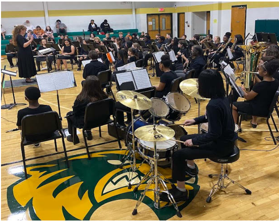
NEMS band students performing in the Fall Night of the Arts.