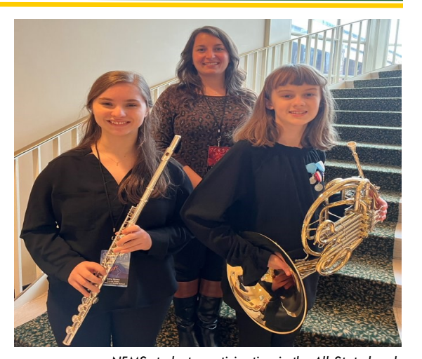
NEMS students participating in the All-State band.