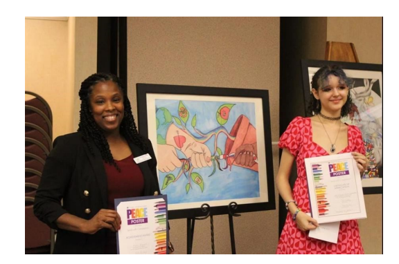
Aiken Lions Club recognizes a NEMS student as the winner of a poster contest.