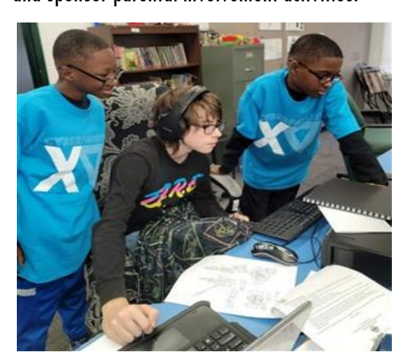
The NEMS CyberPatriot team claimed first place for the third year in a row

New Ellenton Middle STEAM Magnet School is a Title I school that receives federal funding based on the poverty index of our school. This funding is intended to assist in providing programs and educational opportunities to our students. This year, Title I funds were utilized to pay a teacher's salary for class-size reduction, purchase technology, instructional supplies, educational resources, student incentives, to fund professional development opportunities, and sponsor parental involvement activities.