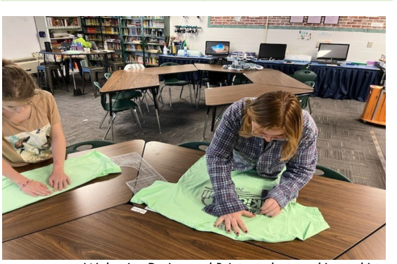
Wolverine Design and Prints students making t-shirts