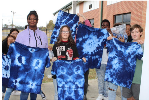
ABC grant funds were used for an artistic exploration of the history of indigo in South Carolina. Students created their own tie-dye t-shirts using indigo.

New Ellenton Middle STEAM Magnet School is a Title I school that receives federal funding based on the poverty index of our school. This funding is intended to assist in providing programs and educational opportunities to our students. This year, Title I funds were utilized to pay a teacher's salary for class-size reduction, purchase technology, instructional supplies, educational resources, student incentives, to fund professional development opportunities, and sponsor parental involvement activities.