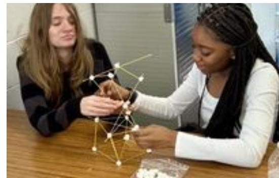
Students using the Engineering and Design Process to create towers.