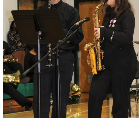
NEMS band students performing in the Fall Night of the Arts.