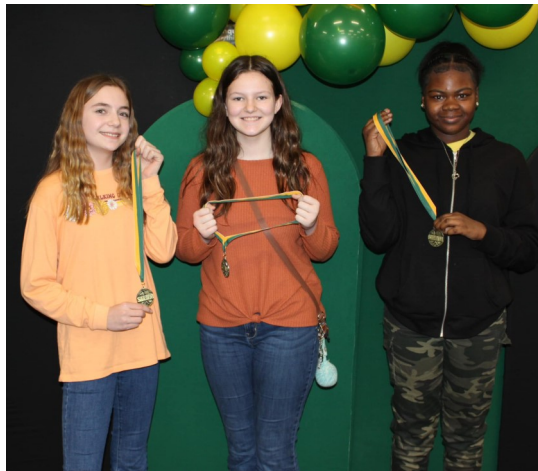
Students showcase their 1st place medals for the schoolwide STEAM project—Project IMPACT.