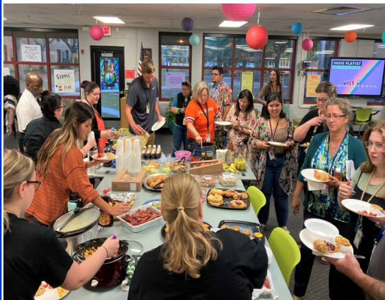
Staff/ Faculty Monthly Breakfast