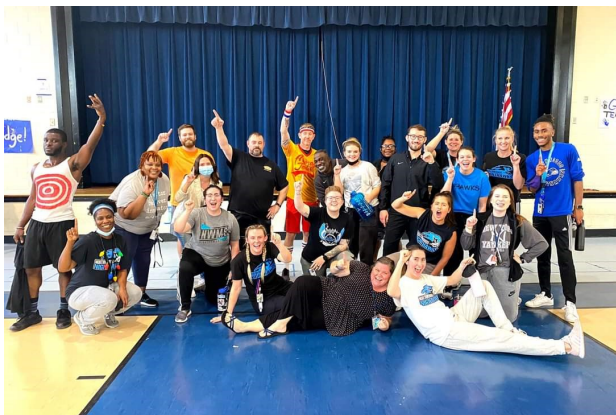
Staff/ Faculty Dodgeball Team