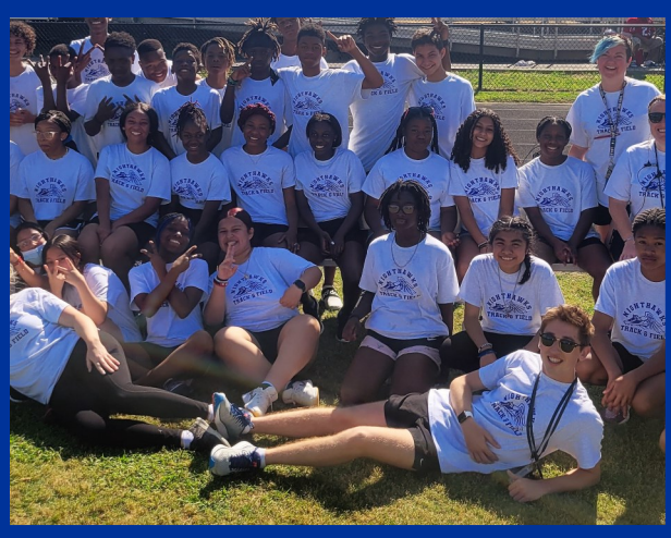
NMS Track Team