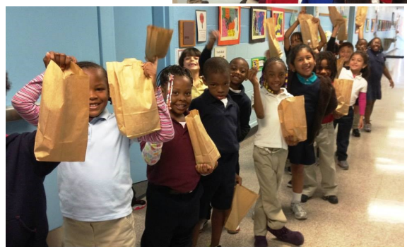
Students went Trick-or-Treating for fun goodies around the school. They received candy, books, snacks and drinks!