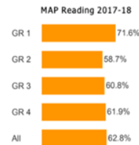
MAP Reading 2017-18