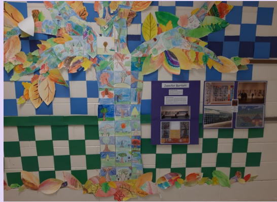
Julian Mitchell ES is known across the district for the many murals and displays of student art and classwork throughout the school.