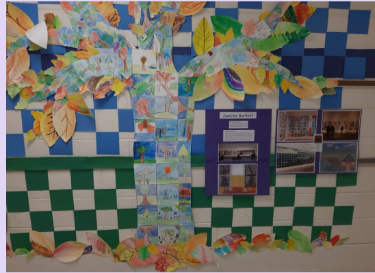
Julian Mitchell ES is known across the district for the many murals and displays of student art and classwork throughout the school.