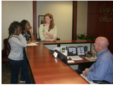
Developing Leaders For Tomorrow!