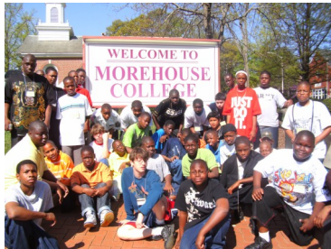
Encouraging the Pursuit of Higher Education!