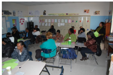
Promoting Parent Education!