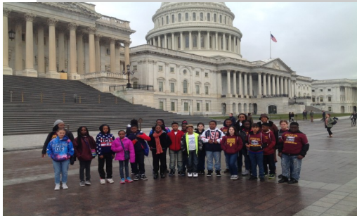
Fifth Grade Trip, Washington, DC