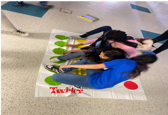
Students playing twister during a PBIS Celebration. They are celebrating positive behaviors

“For more information, you may view Pepperhill E.S., “S.C. School Report Card” for the previous school year online at www.ed.sc.gov .”