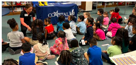
Students participated in Career Week, by having local businesses come in and share their careers with our students.