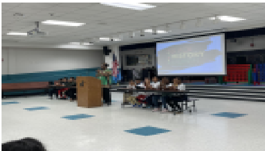
In honor of Black History Month, a selected group of students from the 4th and 5th grade participated in the Black History Bowl.