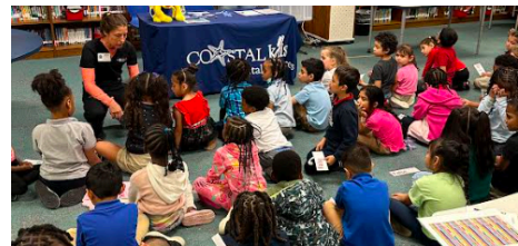
Students participated in Career Week, by having local businesses come in and share their careers with our students.