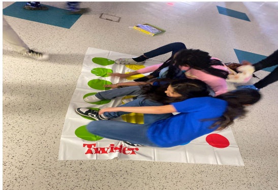
Students playing twister during a PBIS Celebration. They are celebrating positive behaviors

“For more information, you may view Pepperhill E.S., “S.C. School Report Card” for the previous school year online at www.ed.sc.gov .”