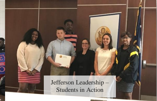
Jefferson Leadership - Students in Action