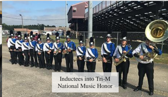
Inductees into Tri-M National Music Honor