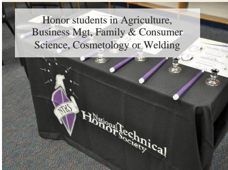
Honor students in Agriculture, Business Mgt, Family & Consumer Science, Cosmetology or Welding