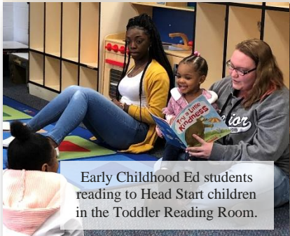
Early Childhood Ed students reading to Head Start children in the Toddler Reading Room.