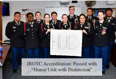
JROTC Accreditation: Passed with "Honor Unit with Distinction"