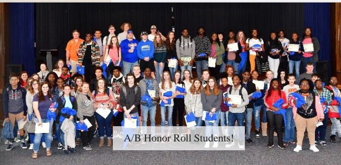
A/B Honor Roll Students!