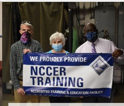
Welding Receives Accreditation