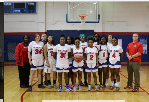
Girls Basketball Team