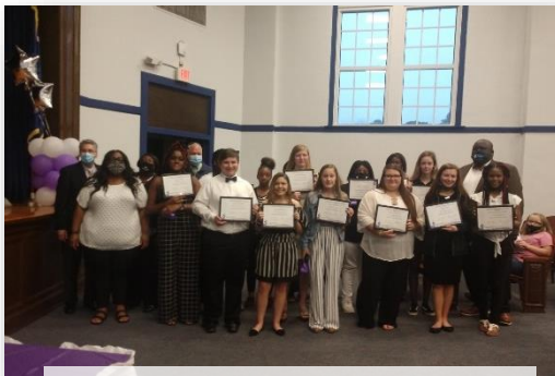
National Technical Honors Society Induction