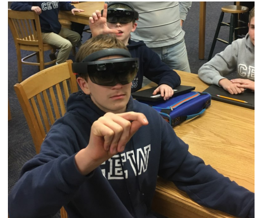
CEW learners had a chance to experience augmented reality firsthand.