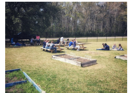
The CEW PTSA purchased tables and benches which were used to provide outdoor classroom space.